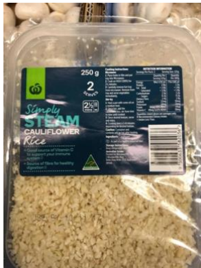
Cauliflower Rice 2